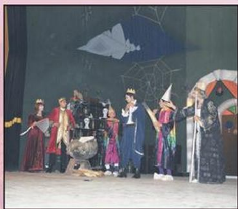
A Scene from English Drama "The Invisible Duke"