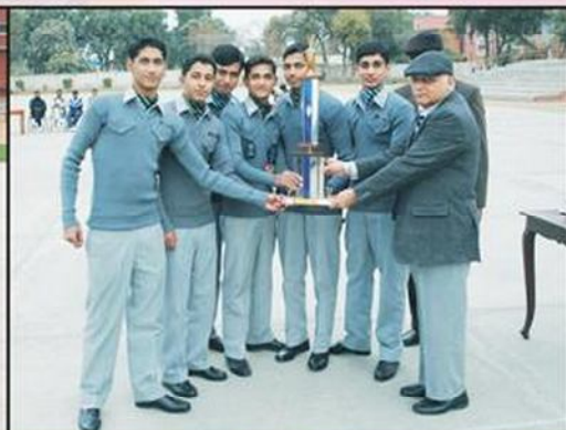
Proud Furians receiving PT Trophy from Principal