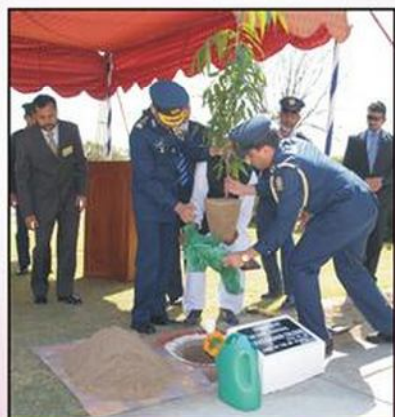
Air Chief Marshal Rao Qamar Suleman planting a sapling

After tea, Air Chief Marshal Rao Qamar Suleman planted a sapling in front of the School Academic Block. At the end, the Chief of Air Staff along with his lady wife and accompanying high officials, visited the School Hobbies Club. They appreciated the young hobbyists a lot for their projects in Woodwork, Arts, Clay and Science Clubs. The apt and pleasing background music by the Music Club during the visit, proved icing on the cake. While departing, the Chief Guest and his lady wife were presented a couple of gifts by the Club.