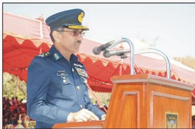
Air Chief Marshal Rao Qamar Suleman addressing the School on Parents Day