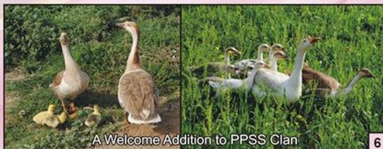
A Welcome Addition to PPSS Clan