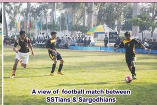
A view of football match between SSTians & Sargodhians