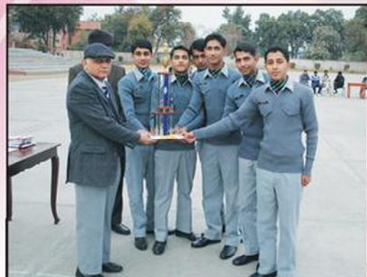
Jubiliant Furians receiving Drill Trophy from Principal