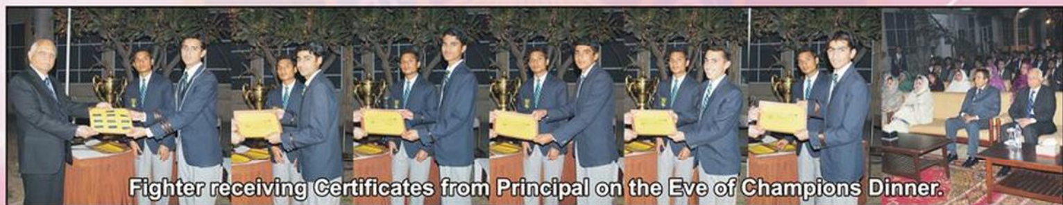
Fighter receiving Certificates from Principal on the Eve of Champions Dinner.