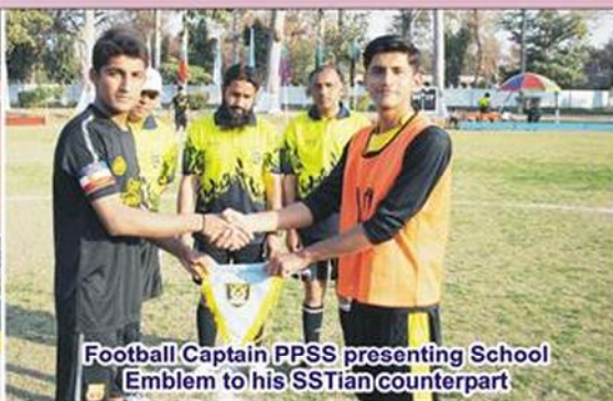
Football Captain PPSS presenting School Emblem to his SSTian counterpart