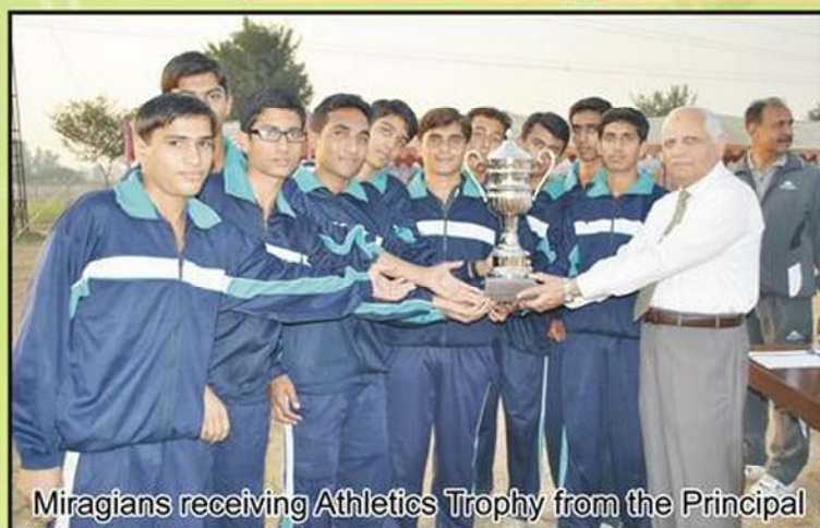
Miragians receiving Athletics Trophy from the Principal