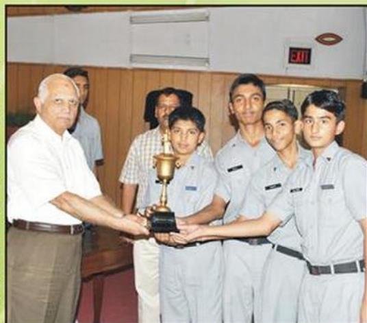
Fighters receiving Declamation Trophy from the Principal