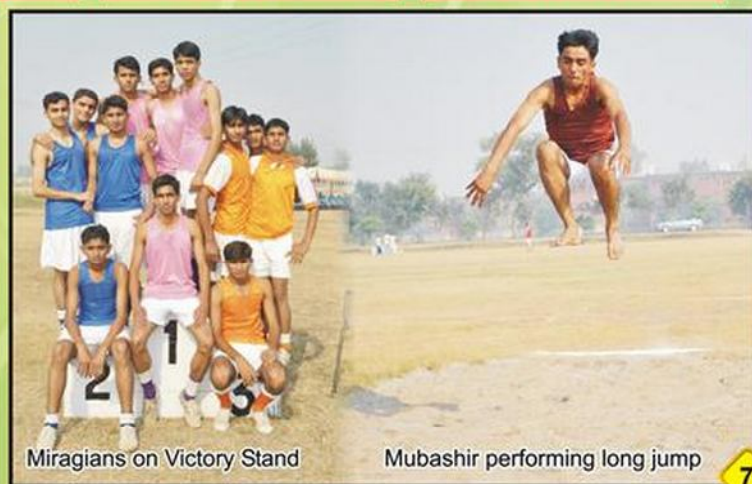
Miragians on Victory Stand