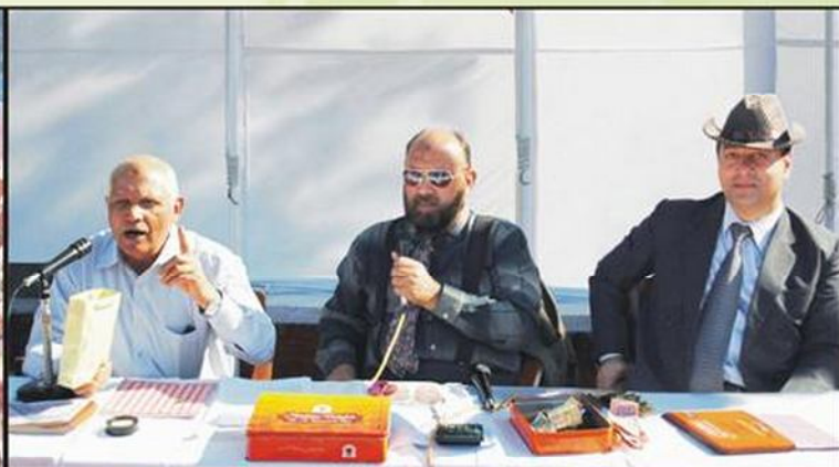
Principal & Officers conducting Tambola