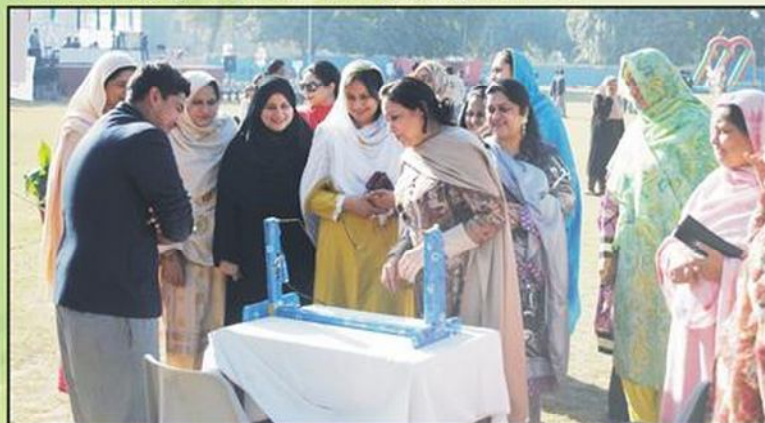
Ladies enjoying themselves on Passing the Ring Stall