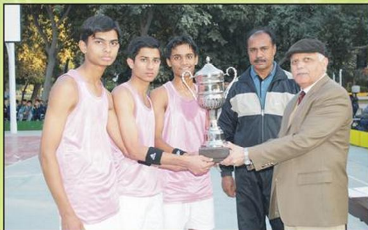
Exhilarated Miragians receiving Basketball Trophy from the Principal

Inter-House Junior Basketball Championship was held from 8 to 14 December, 2011. Mirage emerged as victor. All pool matches were played in fully charged environment. The final was played between Mirage and Starfighter. Mirage outclassed their opponents and lifted the trophy with ease.