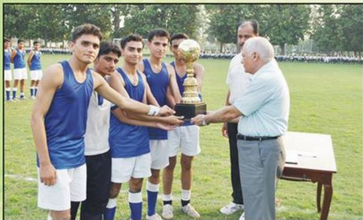
Proud Tempestian receiving Football Trophy from the Principal

The slogans echoed deafeningly in favour of Tempestians from all sides of the field. Falcons fought really hard to equalize in the second half, but Tempestian defence proved to be a solid wall. At last, the final whistle blew and Tempest won by 1-0. The principal gave away certificates to the participants of both the teams and the football trophy to jubilant Tempestians.