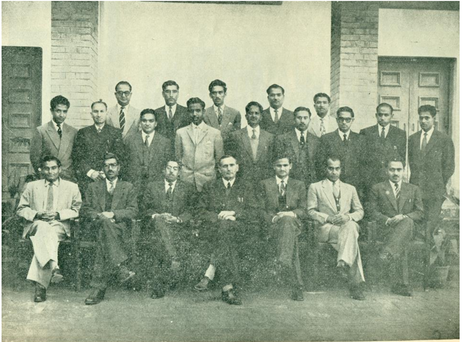
Teaching Staff 1960.