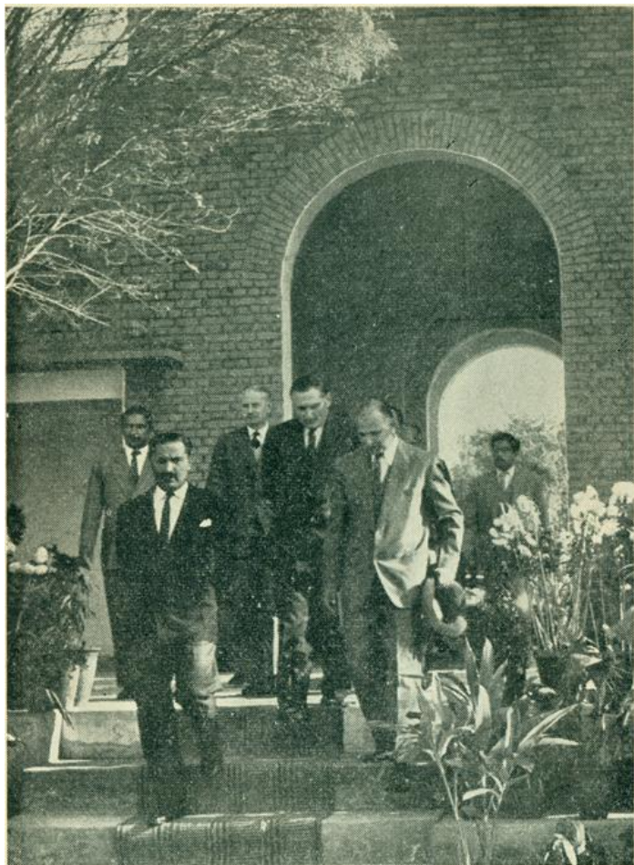
Arrival of C-in-C.