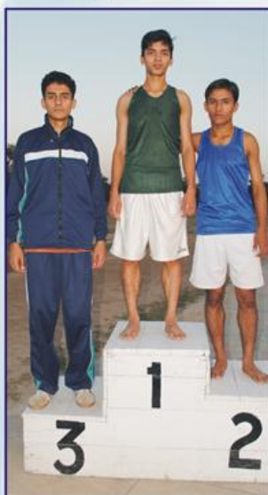
Winners of High Jump