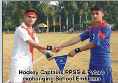
Hockey Captains PPSS & Petaro exchanging School Emblems