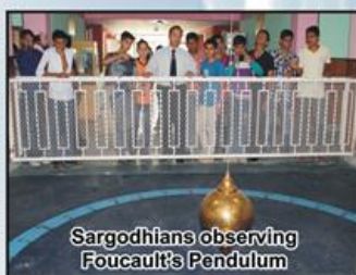
Sargodhians observing Foucault's Pendulum

Later, we enjoyed coke and biryani in the lunch arranged by the School Mess. We left for Sargodha at 1400 Hrs. We opted for the route through Azadi Chowk and had a view of Minaar-e-Pakistan, Badshahi Mosque and Shahi Qila. We were amazed to see the newly built intricate flyover. We reached the School at 1700 Hrs. This interesting and informative trip will surely be a part of our fond memories.