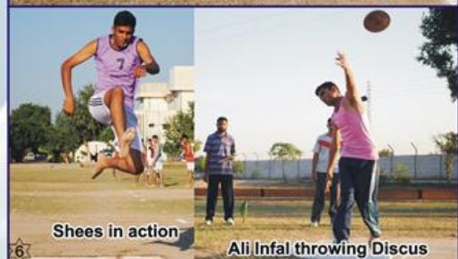
Shees in action