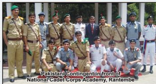
Pakistani Contingent in front of National Cadet Corps Academy, Rantembe