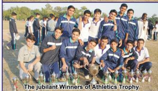
The jubilant Winners of Athletics Trophy