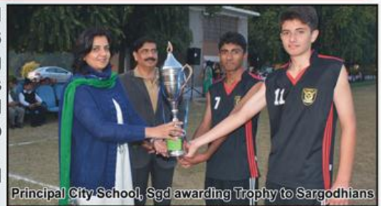
Principal City School, Sgd awarding Trophy to Sargodhians

A friendly Football Match was played between the School Junior Team and the City School, Sargodha Football Team on 26 November, 2014. The match was played in a very lively and exciting environment as spectators from both schools kept raising slogans and cheering their respective teams. The Sargodhians remained dominating throughout the match and did not give much chance to their guests to score any goal. The Sargodhians won by 5-0. Irrespective of the match result, the occasion served as good source to strengthen the friendly ties between both schools.