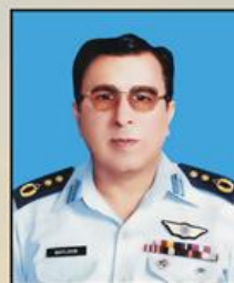
Gp Capt Matloob Bokhari

Let us celebrate the festival of love By burning candles of love in the streets of hatred By teaching students to tolerate intolerance By enlightening learners to see through minds By growing blossoms of forgiveness in our souls