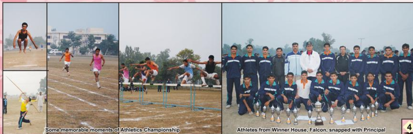
Some memorable moments of Athletics Championship