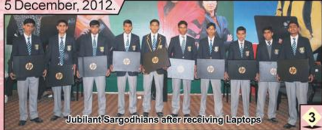
Jubilant Sargodhians after receiving Laptops

Like previous year, Sargodhians were awarded laptops this year too for their outstanding SSC part-II exam results under the Education Promotion Programme of the Government of the Punjab. 11 Pre-cadets from 42 nd Entry who secured a mark percentage of 92% and above received laptops during a ceremony held at the University of Sargodha on 5 December, 2012.