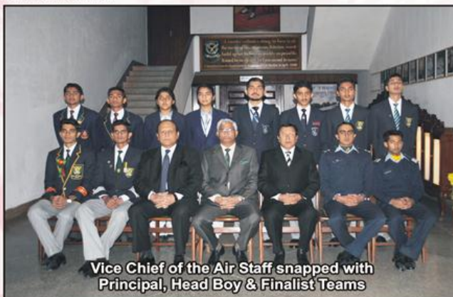
Vice Chief of the Air Staff snapped with Principal, Head Boy & Finalist Teams