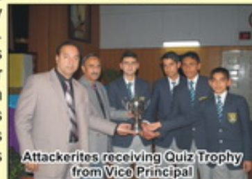
Attackerites receiving Quiz Trophy from Vice Principal

January, 2014 separately for juniors and seniors. Every house was represented by one junior and one senior team comprising two members each. The contestants were asked questions from their respective