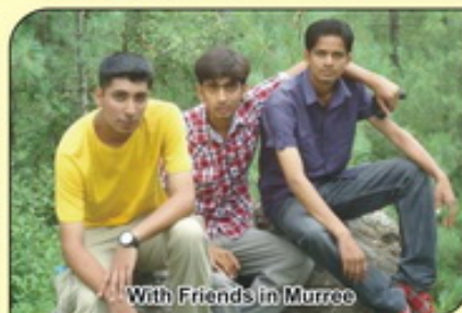
With Friends in Murree