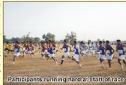
Participants running hard at start of race

The show of true stamina is the Cross Country Championship. The competitors have to run a distance of about 3.5 km and each team consists of 8 boys. The favourites were the Tempestians this time whereas, the defending champions were Miragians. The competition was held on 9 December, 2013. The race began when whistle blew. All the participants ran hard. After almost eight minutes two boys came into view running together.