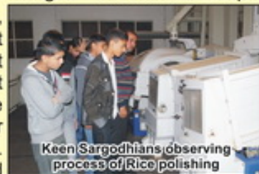
Keen Sargodhians observing process of Rice polishing