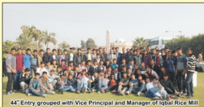
44 th Entry grouped with Vice Principal and Manager of Iqbal Rice Mill