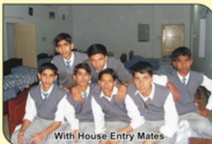
With House Entry Mates