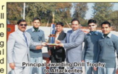
Principal awarding Drill Trophy to Attackerites

The Inter House PT and Drill Contests were held on 26 January, 2014. The campus kept echoing with the youthful commands and slogans for days as the