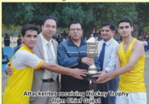
Attackerites receiving Hockey Trophy from Chief Guest