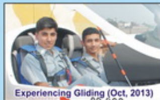
Experiencing Gliding (Oct, 2013)

A fine thorough gentle man, A great leader, a worthy man He has crossed life's border, On the Almighty's order But he is here, in our hearts, Even if it's time to part