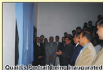
Quaid's Portrait being Inaugurated