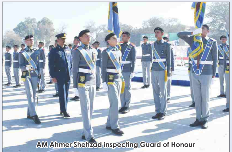
AM Ahmer Shehzad inspecting Guard of Honour