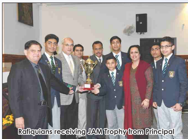
Rafiquians receiving JAM Trophy from Principal