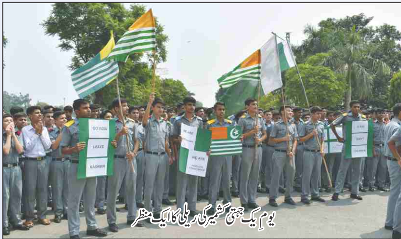
یوم یک جہتی کشمیر کی ریلی کا ایک منظر