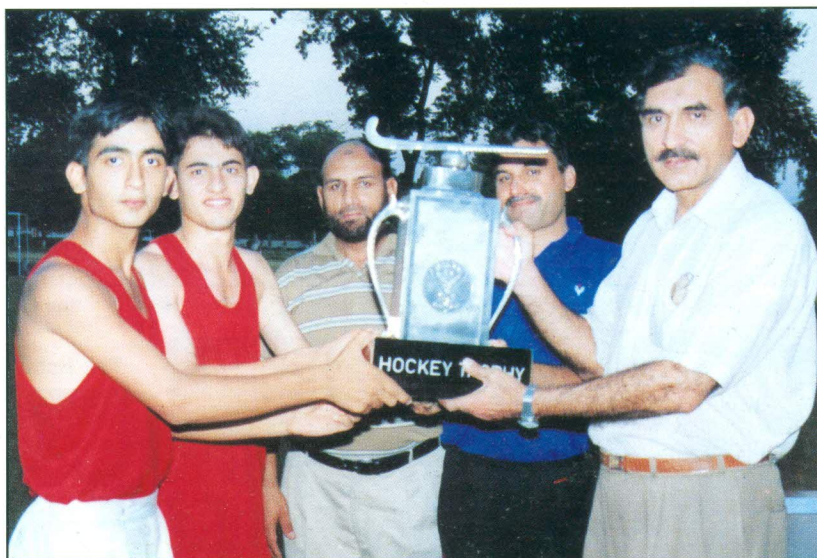
Proud Furians receiving the Hockey Championship Trophy from the Principal