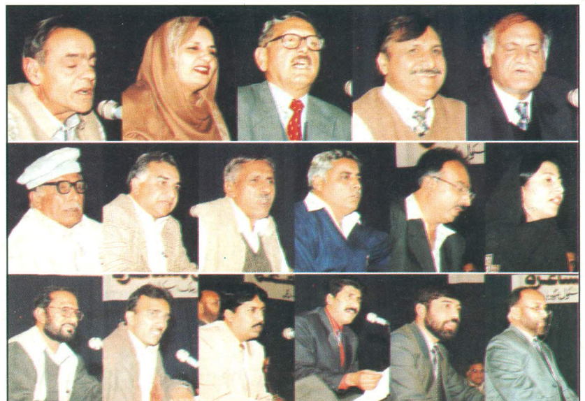
The galaxy of poets enthralling the audience