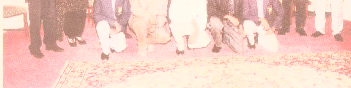
The Chief Guest snapped with the cast of the English play