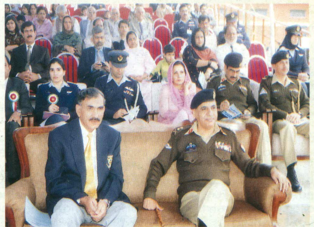
The Chief Guest on the occasion of the Parents Day

Later on the Chief guest along with the old Sargodhians proceeded to the School History Room and the Hobbies Club Display. He appreciated the skills and talent of young artists. The Hobbies Club, also, presented to the Chief Guest his portrait and Quranic Verses done in woodwork by Sargodhians. After this the Chief Guest and other dignitaries departed.