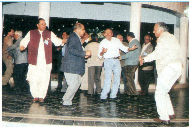
The Old Boys in high spirits reliving the good old days

Editor: Latif Noonari Reporter: Mohsin Muneer