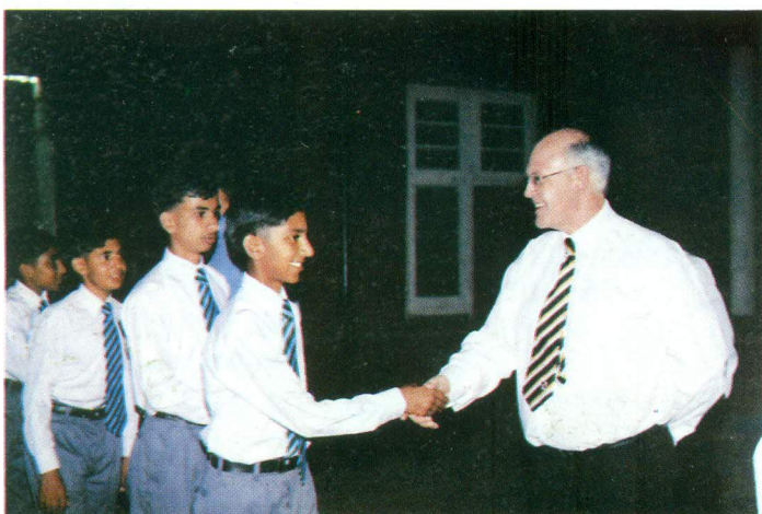
The Principal welcoming the 40th Entry boys

Upholding the School traditions, the Principal hosted a sumptuous dinner for the 40th Entry at the spacious lawns of his residence on 27 April, 2007. Also invited were the Housemasters, House Captains and the Head Boy. The bright-eyed boys did justice to different courses of a well cooked food. A lavish supply of ice-cream followed the dinner. After all this, the young boys entertained the gathering with wonderful songs and jokes. The new entry seemed confident as there was along line of boys eager to take the stage.