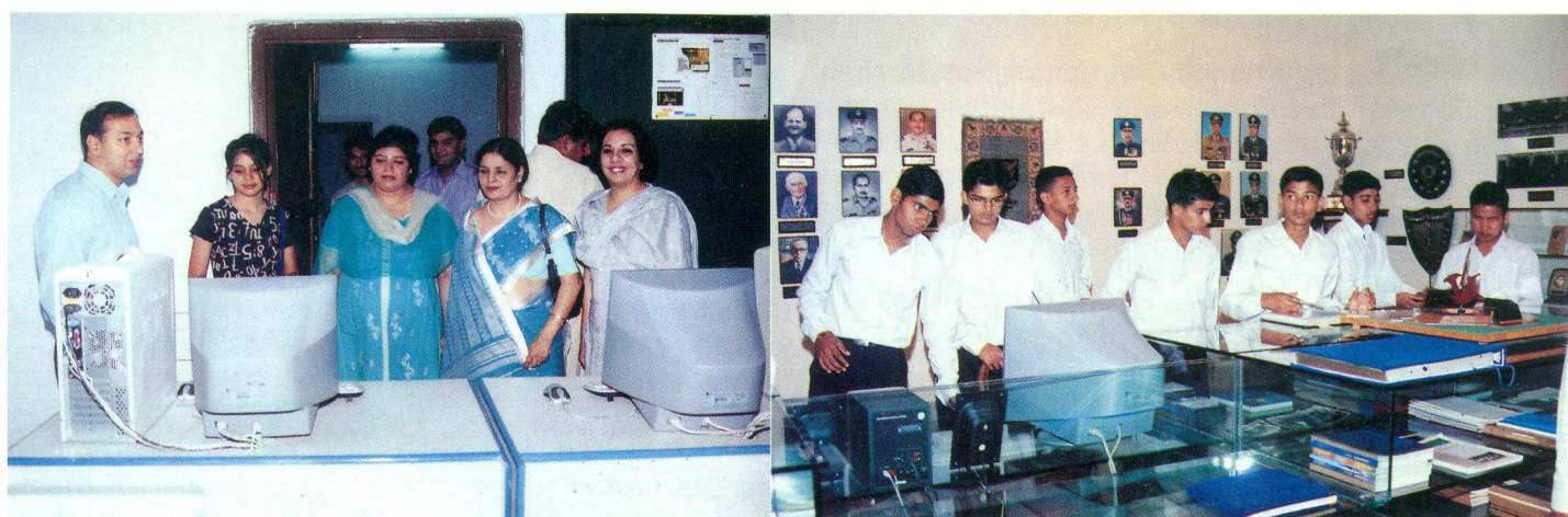
The visitors from Rashtriya Indian Military College Dehradun in the School Computer Lab and History Room

With a hope to see more of each other in future, the visitors were seen off warmly.