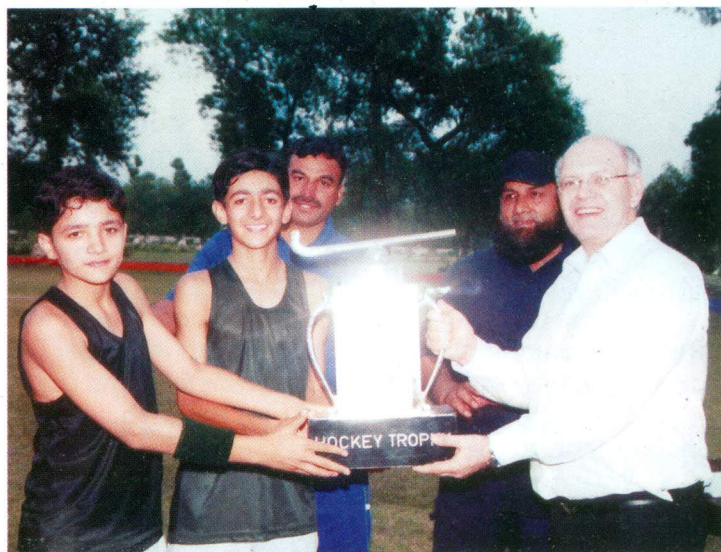
Beaming young Sabrites receiving the trophy from the Principal