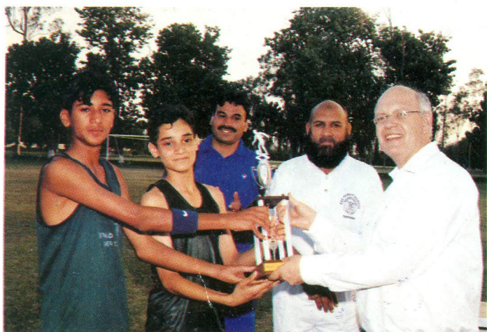
Sabrites receiving football trophy from the Principal

On 23 April, 2007, Sabre House emerged as new champion by winning the Inter House Junior Football Championship - 2007. After very exciting pool matches, Attacker, Fury, Mirage and Sabre had made to the semi-finals. Sabre and Fury defeated Mirage and Attacker respectively to play the final, which Sabre won in the sudden-death round after a very tough match. The Principal gave away the trophy to beaming Sabrites.