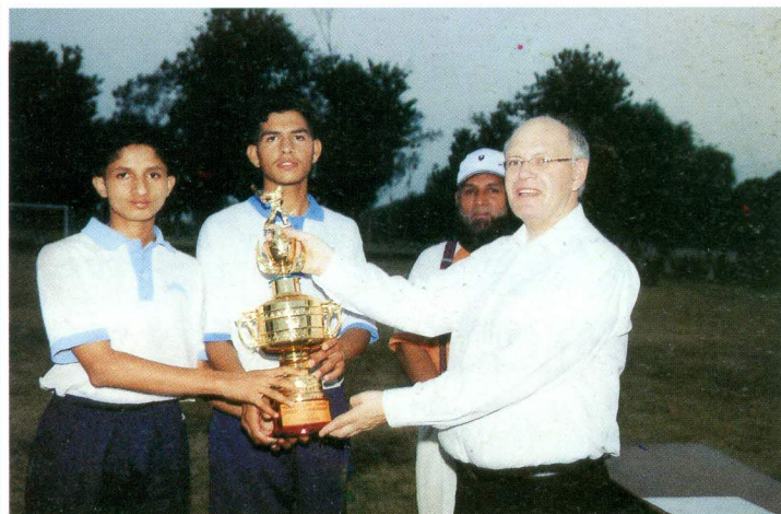
Serious looking Halifaxians receiving Cricket Trophy from the Principal