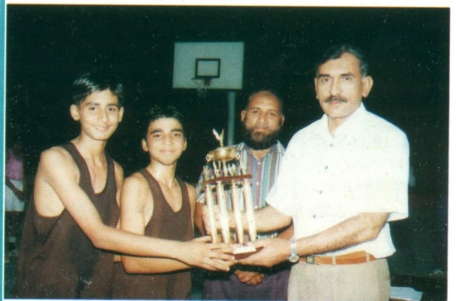
The beaming Fighters receiving their prize