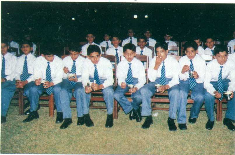
The young Sargodhians of 39th Entry enjoying the ice cream