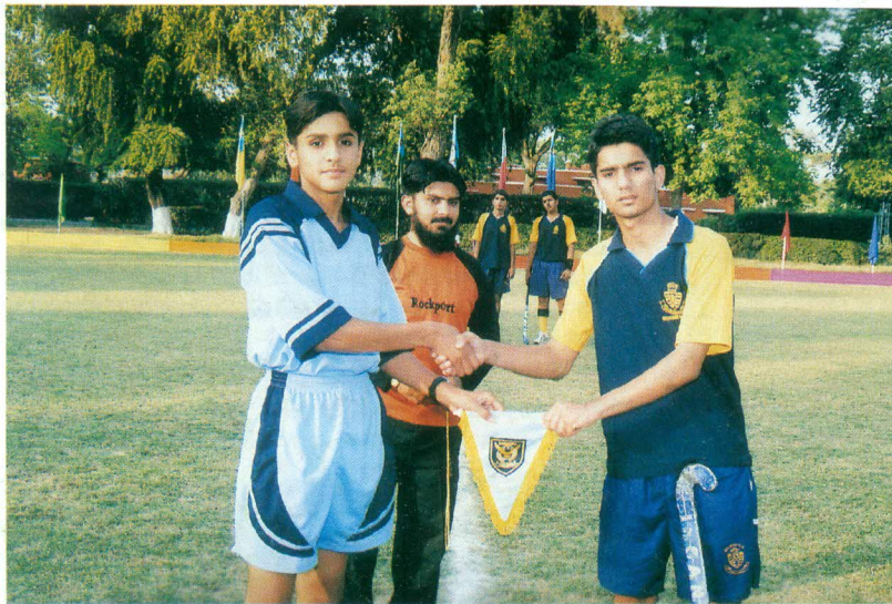
The bonds being strengthened by the two captains

At the end the two representative boys exchanged the thank you notes and promised to continue the gesture as irrespective of the outcome of the matches, the fixture did the essential job of bringing boys of the two institutions into the bond of friendship.