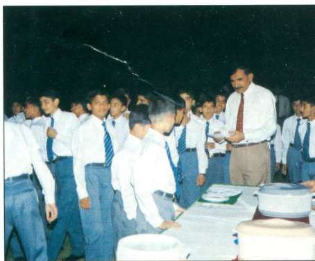
The Principal sharing potluck with the new Entry