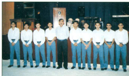
The New Head Boy and the House Captains snapped with the Principal

Also, on this occasion the former Head Boy handed over the Head Boy's Cane