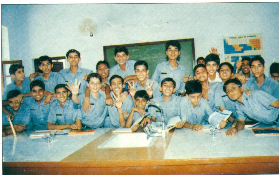
The jubilant young Sargodhians displaying their mirth in the renovated Chemistry Lab