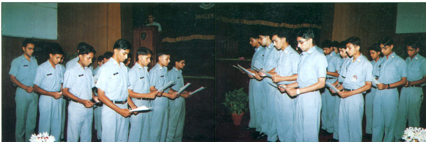
The New Appointment Holders taking Oath of Allegiance to the institution