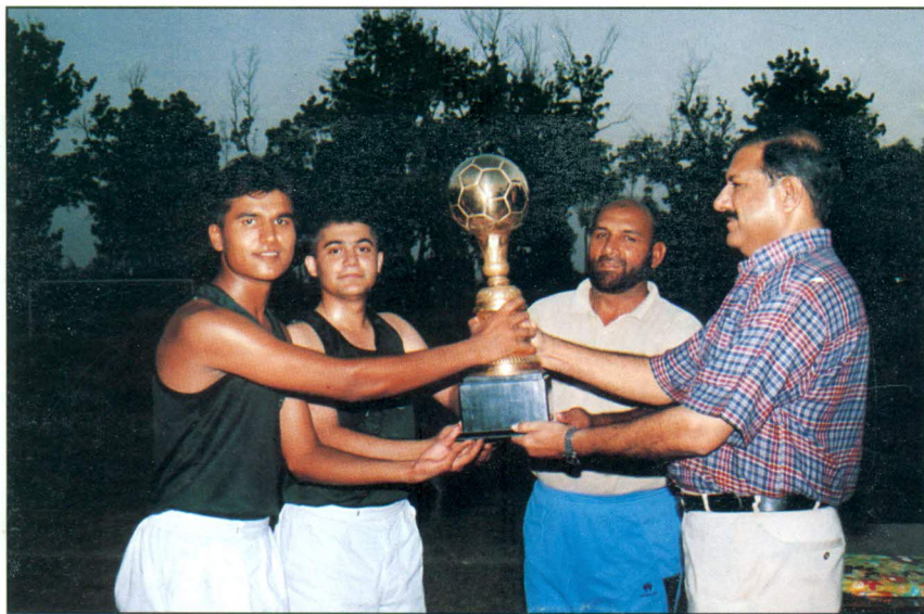
Swift Sabrites receiving the Football Trophy from the Vice Principal