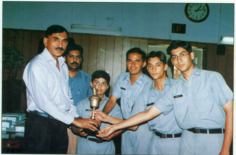
Eloquent Halifaxians receiving the Declamation Trophy from the Principal