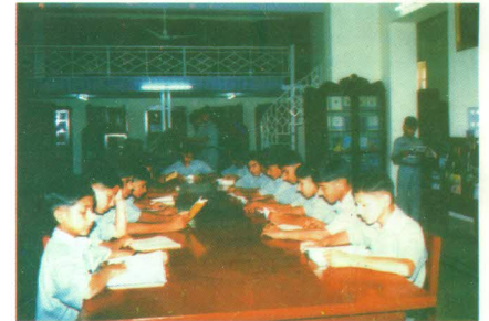
The renovated School Library

The old houses Attacker, Fury, Sabre and Tempest have been completely renovated. The entrance area on all floors, the changing areas and toilets have marble tiles. In the changing areas, the steel almirahs have been replaced with built-in wooden cupboards. On the ground floor, the study area and the library room, too, have new ceramic tiles. Besides, all the electric wiring is now concealed. The dormitories on the top floor have been provided desert coolers to keep them bearable in the summer season. The houses have also been furnished with new school curtains.