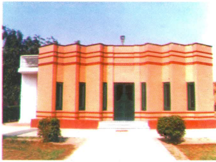
The Renovated School Canteen