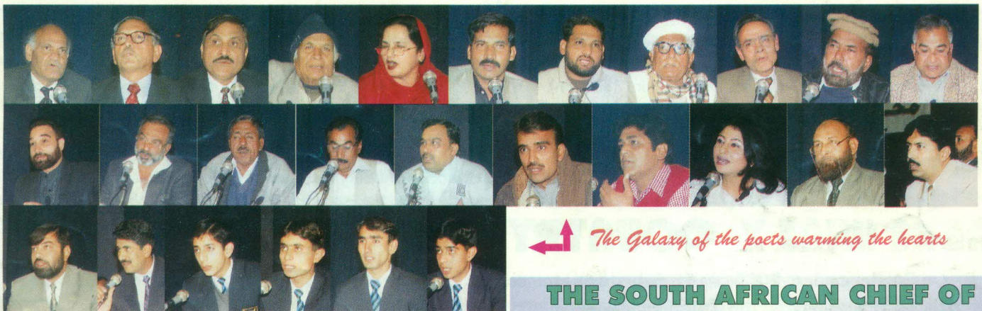
← The Galaxy of the poets warming the hearts

Like last year, this year, too, the School organized a Mushaira on 17 December, 2005. Renowned poets of the country warmed the hearts of a very receptive audience.