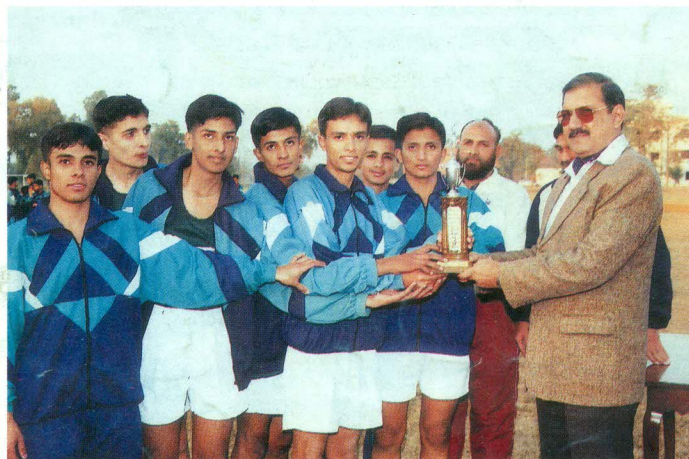
The Vice Principal awarding the X-Country Trophy to Sabrites

The Entry Test for the 39th entry was held at Lahore, Sargodha, Rawalpindi, Multan, Karachi, Hyderabad, Sukkur, Peshawar, DI Khan and Quetta centres simultaneously on 04 December, 2005. The entry is expected to join the School in April, 2006.