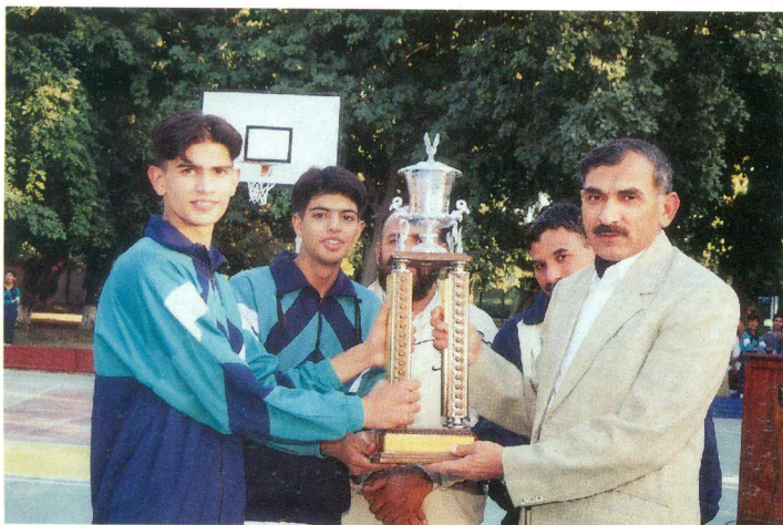
The Principal giving away the Basketball Trophy to the Falconites