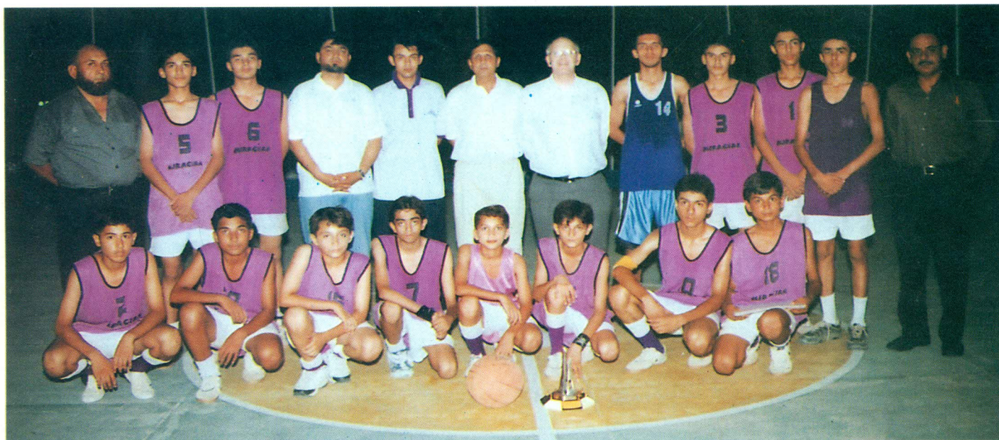
Miragians with the Principal and Vice Principal

win, the Miragians also won the Minhas Trophy for being the Overall Junior Champions in Sports.