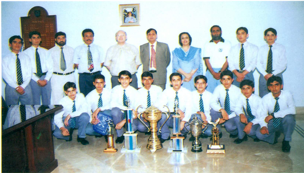
Joyous Tempestians snapped with the Principal and Vice Principal