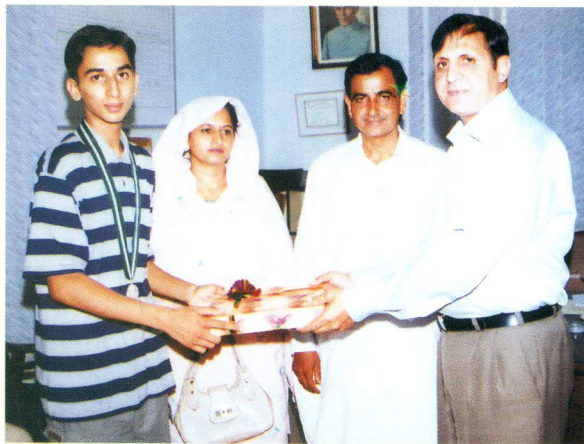
Left: Each of the Top Achievers receiving the traditional box of sweets from the Vice Principal