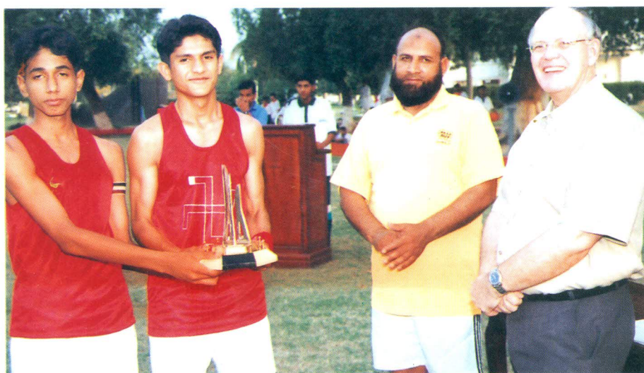
The Principal shares the joy of the Furians

Junior Hockey Championship was played from 26 th May to 2 nd June, 2008. Every house was quite determined to grab the honour of becoming the Junior Champion. The Furians and Falconites made it to the final. The Furians played better and won by one goal to nil. The Principal gave away the trophy to the winners.