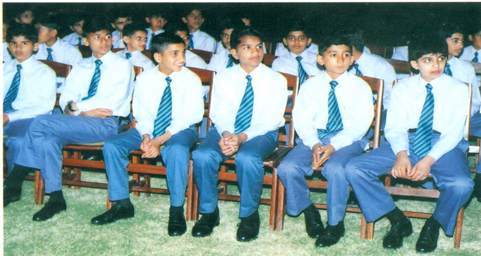
Young Sargodhians enjoying a skit during dinner hosted by the Principal