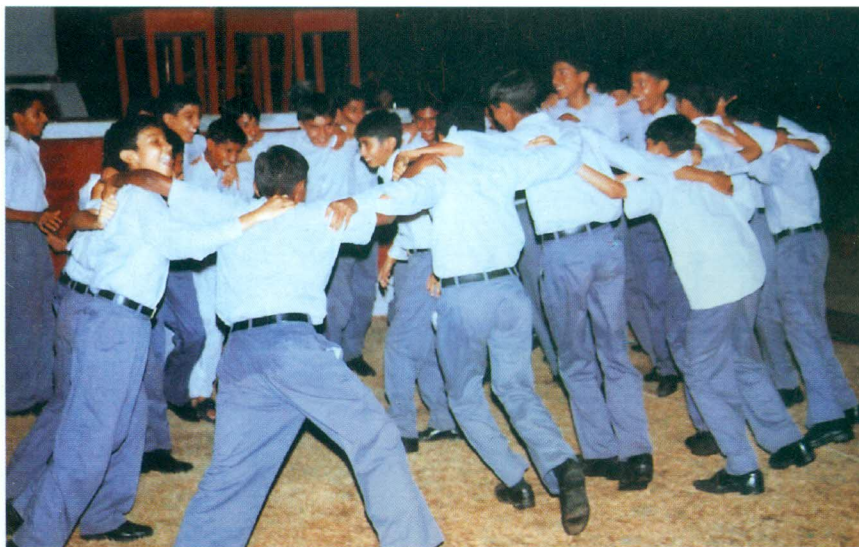
Young Sargodhians dancing to the music