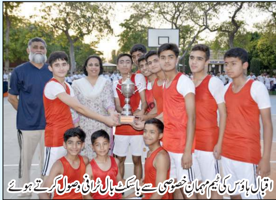
اقبال ہاؤس کی ٹیم مہمان خصوصی سے باسکٹ بال ٹرافی وصول کرتے ہوئے

پی اے ایف کالج سرگودھا اپنے سینیئر اور جونیئر پری کیڈٹس کو تعلیم کے ساتھ ساتھ دیگر ہم نصابی اور خاص طور پر جسمانی سرگرمیوں میں شمولیت کے