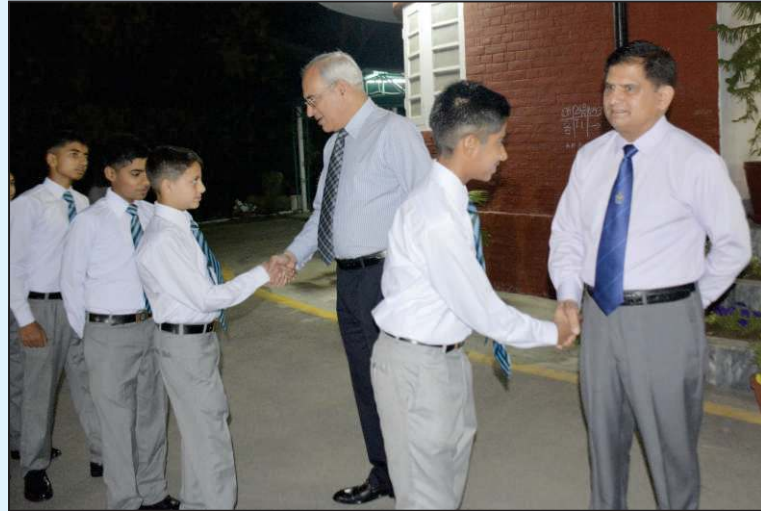
Principal and Vice Principal receiving 52 nd Entry Boys