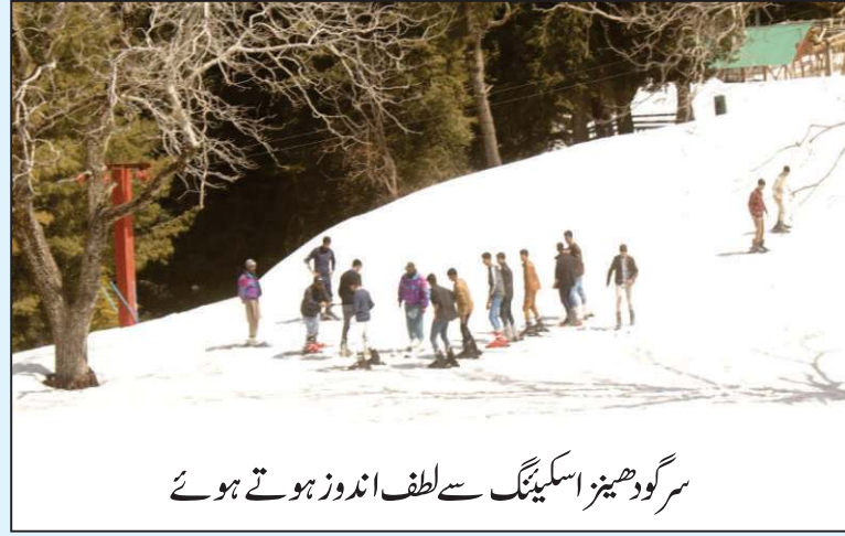
سرگودھیز اسکیٹنگ سے لطف اندوز ہوتے ہوئے