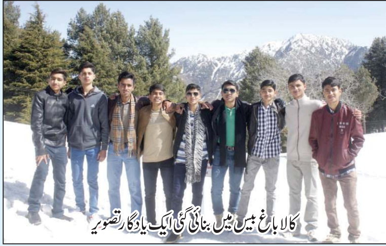
کالا باغ بیس میں بنائی گئی ایک یادگار تصویر