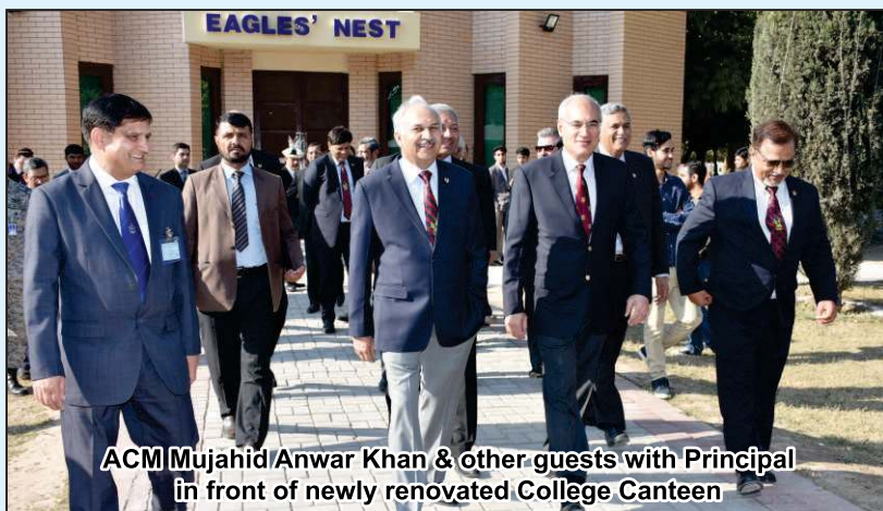
ACM Mujahid Anwar Khan & other guests with Principal in front of newly renovated College Canteen