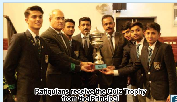
Rafiquians receive the Quiz Trophy from the Principal