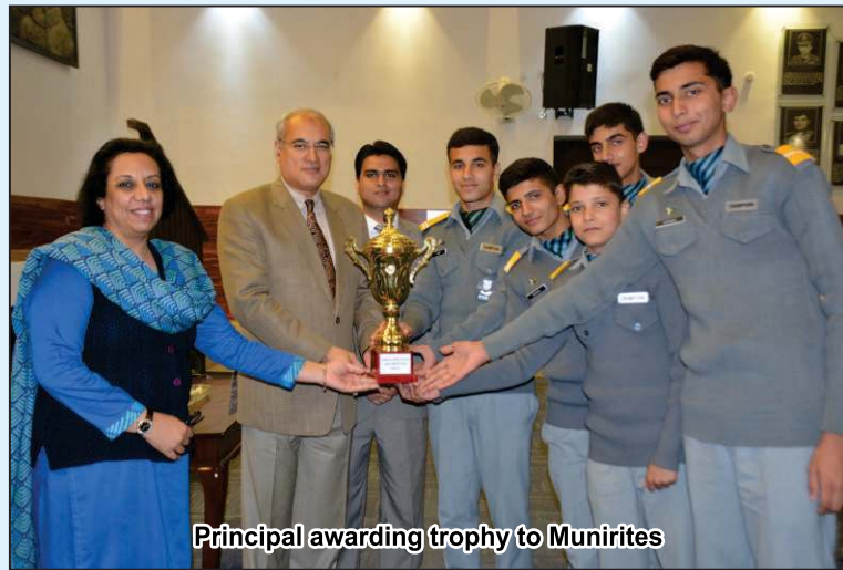
Principal awarding trophy to Munirites