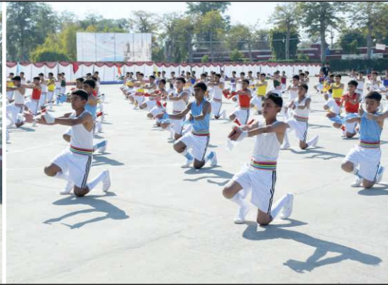
PT Squad at their best