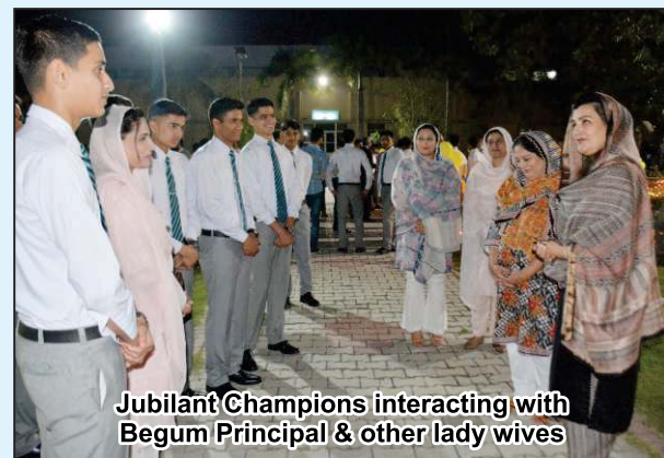
Jubilant Champions interacting with Begum Principal & other lady wives