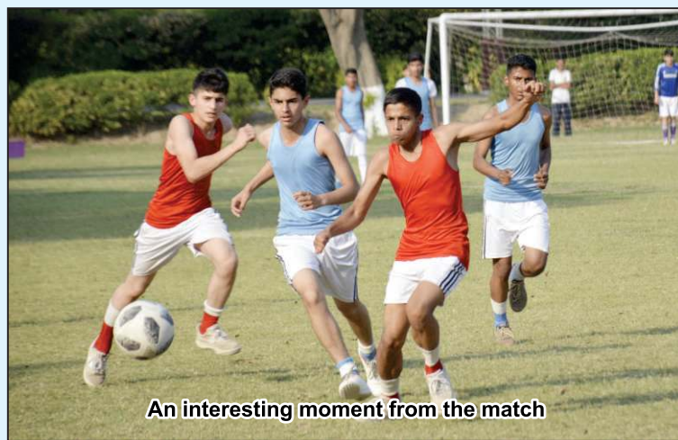
An interesting moment from the match